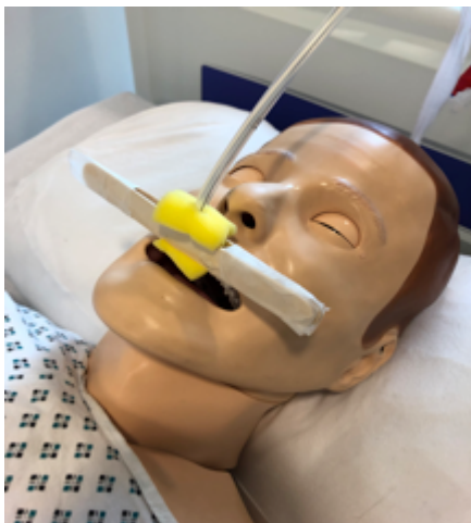
Fig.3 - How to secure the SBT at the mouth